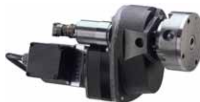
RGA (variant) Fluid media through centre.