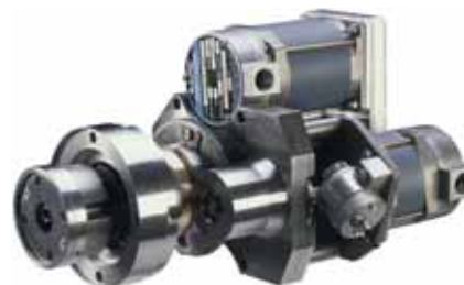
AD (variant) Shell-cylinder system. Sidelay and circumference integrated.